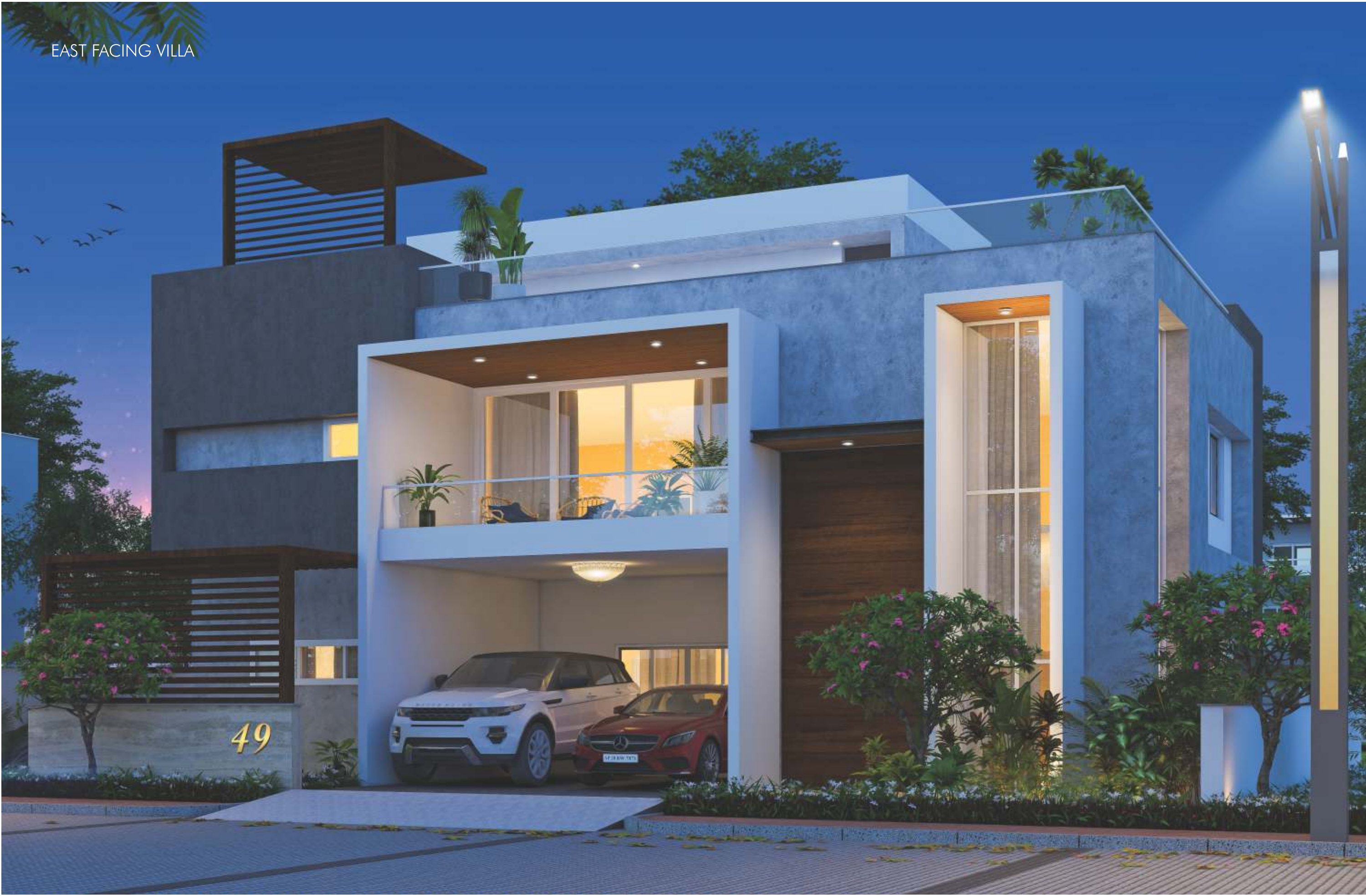
EAST FACING VILLA