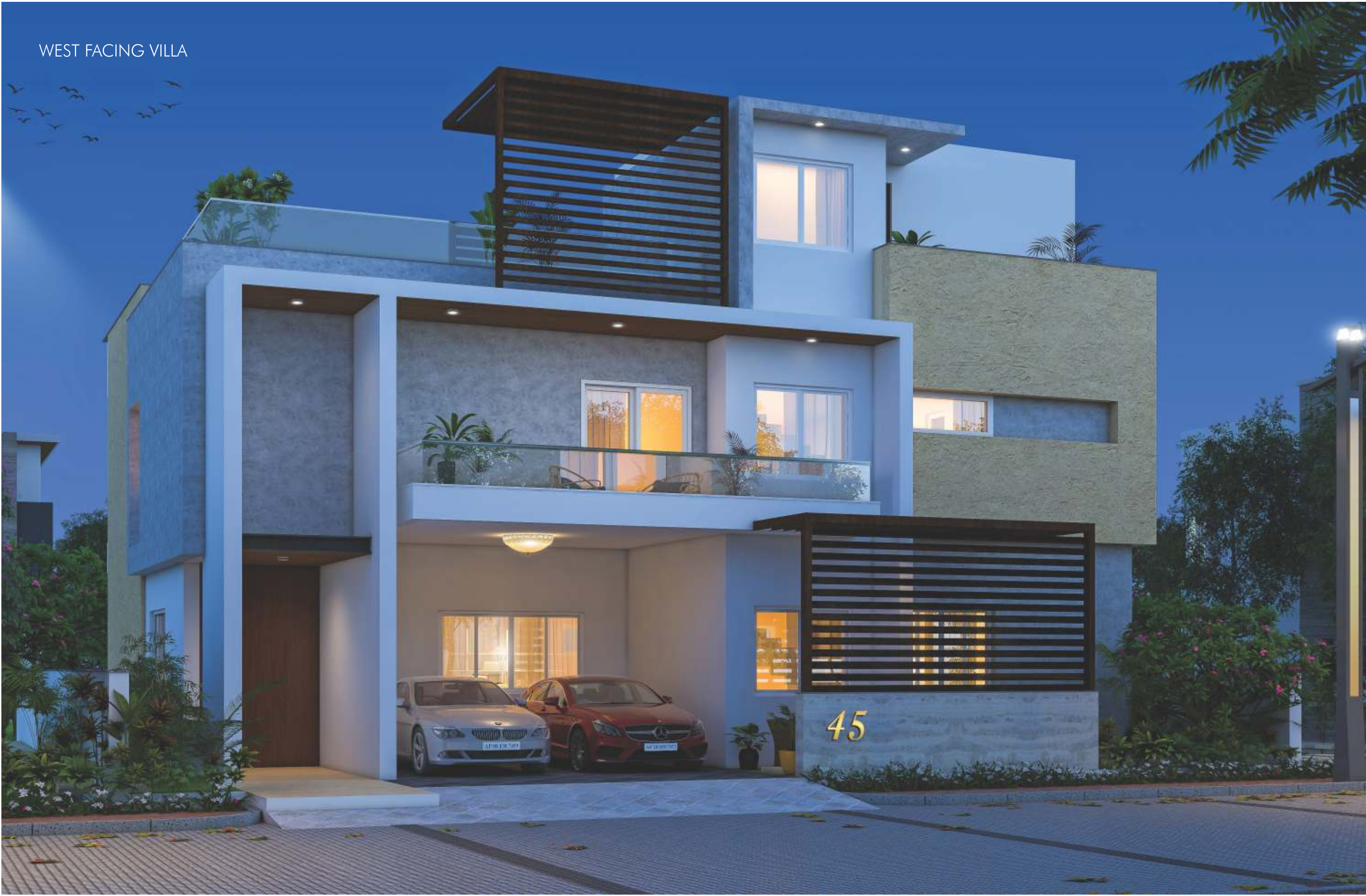
WEST FACING VILLA